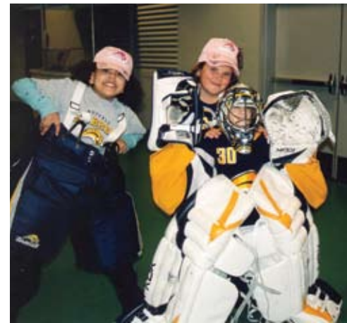
Trying on Ryan Miller's equipment

Additionally, the Sabres and New Era Hat Cap Co. sponsored a hat sale, proceeds of which benefitted the Fund. Before the March 10 th Sabres game vs. the NY Rangers, 500 autographed, one-of-a-kind pink Sabres hats were sold in record time and an additional $10,000 was raised.