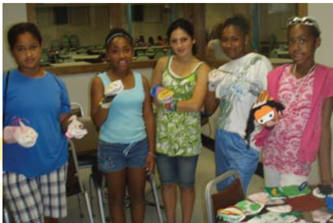
Scholarship recipients from Holy Angels Soaring High Summer Program display puppets that they created as a charity project for at-risk children.

According to a recent study done by Johns Hopkins University, low income students lose 2.6 months of grade level equivalency in math and 3.0 months in reading during their summer recess from school. This new Woman's Fund initiative is part of our continuing efforts to promote success in school, with the ultimate goal of higher high school graduation rates among girls in our community. This particular effort provided scholarships to low income, middle-school aged girls so they are able to attend various summer camps offered through Buffalo Academy of the Sacred Heart, Buffalo Seminary, Holy Angels Academy and Mount St. Mary's Academy. The expected outcome of the summer camp scholarship program is that the grantees will experience the advantages that a structured camp experience offers, such as strengthening academic skills, and providing athletic, social and cultural experiences that they would otherwise not receive.